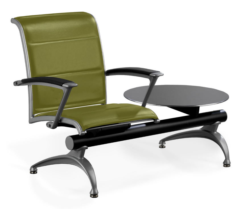
CX5U2B CX Modular Two Position Upholstered Seating with Fixed Arms and Table